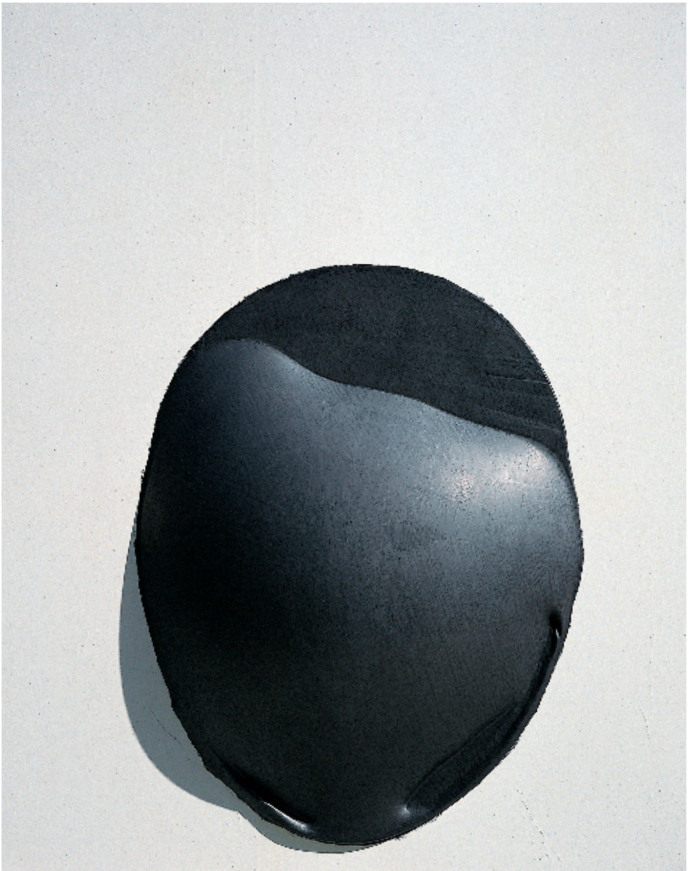
Above, Sphere , 1994, vinyl glue, graphite, Japanese handmade paper, canvas, 5¼ by 4¼ feet.