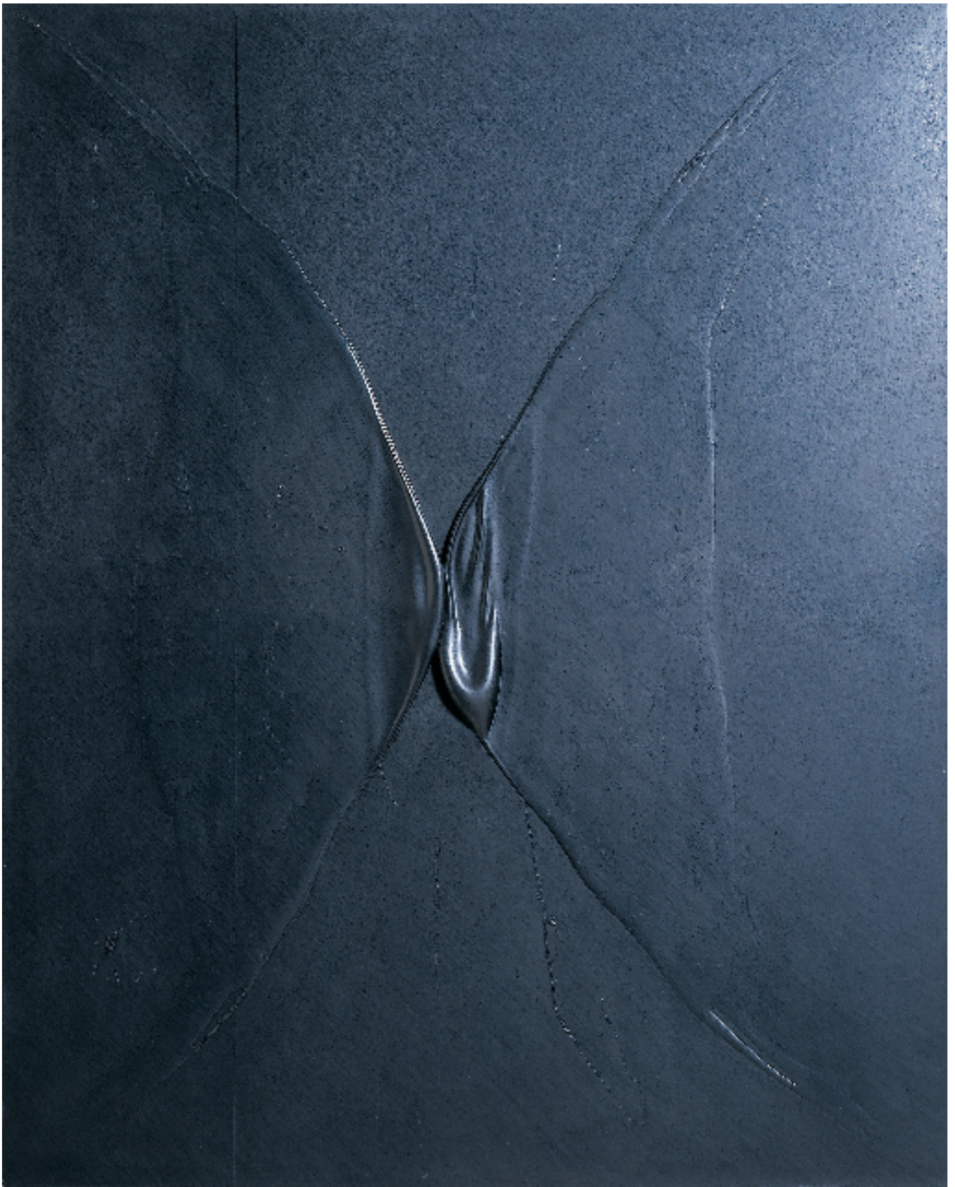
Joint 2-86 , 1986, vinyl glue, graphite, Japanese handmade paper, canvas, 5¼ by 4¼ feet.